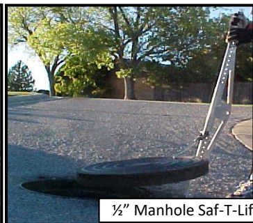
1/2" Manhole Saf-T-Lift – MH-STL-64.50